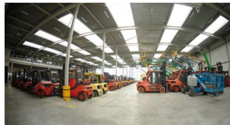
New building, ground floor interior