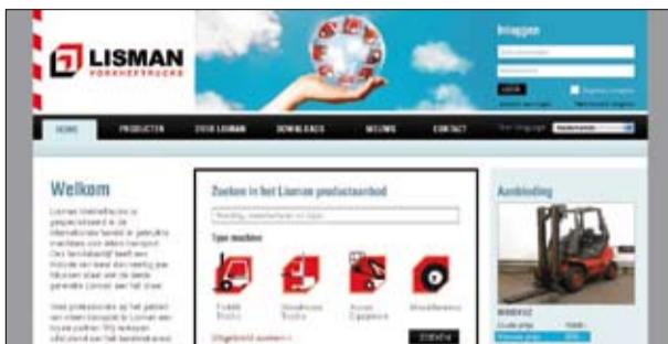
Stock selection function

A specialist web-developer has been commissioned by Lisman to work on a new website, which will offer you lots of interesting possibilities. You will be able to navigate very easily through our stock of machines to make a selection. With a login code, you can also gain access to the protected part of the website: 'My Lisman'. Here you can view previous transactions on your own personal page – your Lisman history. You can also receive tailored information from us via this page. The new site will go 'live' at the start of 2010. By then you will find the information on our site that you need to request your personal login code, which will give you access to 'My Lisman'. We hope that you will enjoy this new portal for used machines, and find it easy to use!