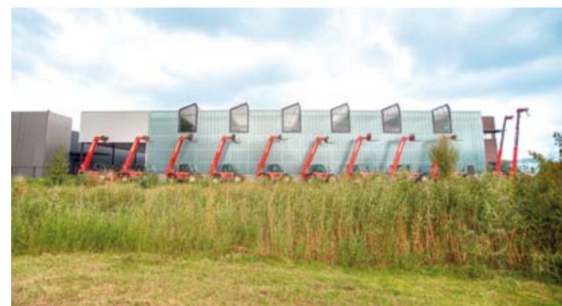
New building, Kamerlingh Onneslaan, side view

And because a tour of the extensive range can last a while, we will also be happy to offer you lunch in our company restaurant at our main branch. We look forward to you visiting our showrooms and think that a tour of Lisman will certainly lead to a purchase that you find appealing.