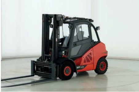
165286 - LINDE H-50-D-02-600 (394)