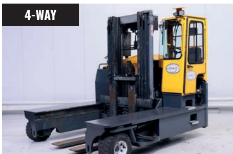
162886 - COMBILIFT C-8000