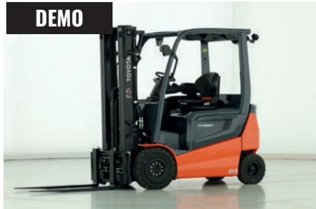
164785 - TOYOTA 9-FBMK-25-T