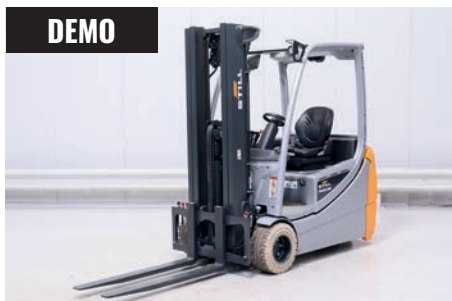
163830 - STILL RX-20-20-L