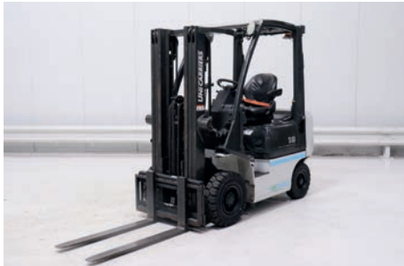
164040 - UNICARRIERS Y-1-D-1-A-18-Q