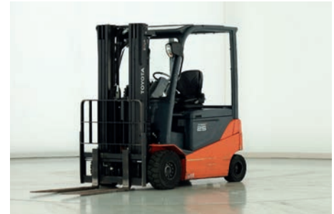
165230 - TOYOTA 8-FBMKT-25