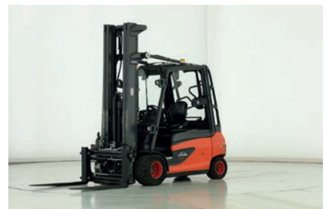
162721 - LINDE E-35-L-01 (387)