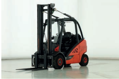
165505 - LINDE H-30-T-02 (393)