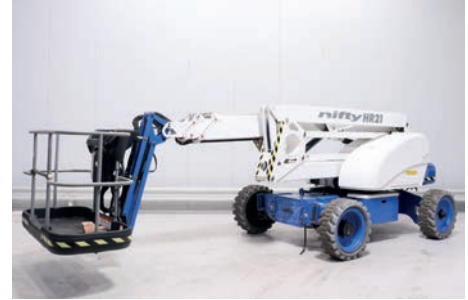
164741 - NIFTY LIFT HR-21-DE-2-WD