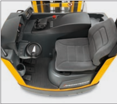
Ergonomic operator cab