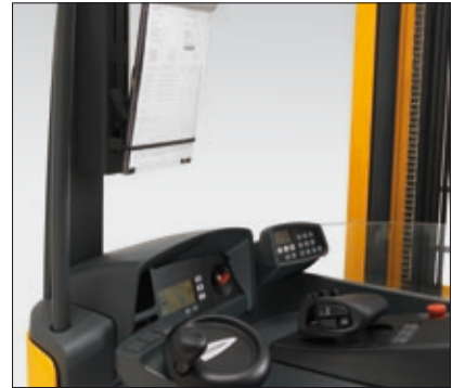
Wide variety of options packages